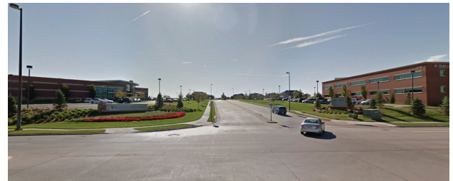
As you enter 175th Street from Burke Street, Building 110 is to your right.

Multispecialty Clinic, including: Level two Allergy and Immunology, Bariatrics Center, Dermatology, Gastroenterology, General Surgery, Men's Health, Nephrology, Neurology, Neurosurgery, Olson Center for Women's Health, Orthopaedics, Physical Medicine and Rehabilitation, Primary Care, Psychiatry, Rheumatology, Urology and Vaccine and Safe Travel Clinic