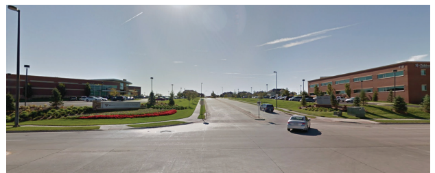
As you enter 175th Street from Burke Street, Building 111 is to your left.

Radiology Lower level Coffee Cart Lower level