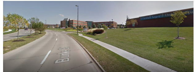
Note that you may only access this entrance driving eastward on Burke St.